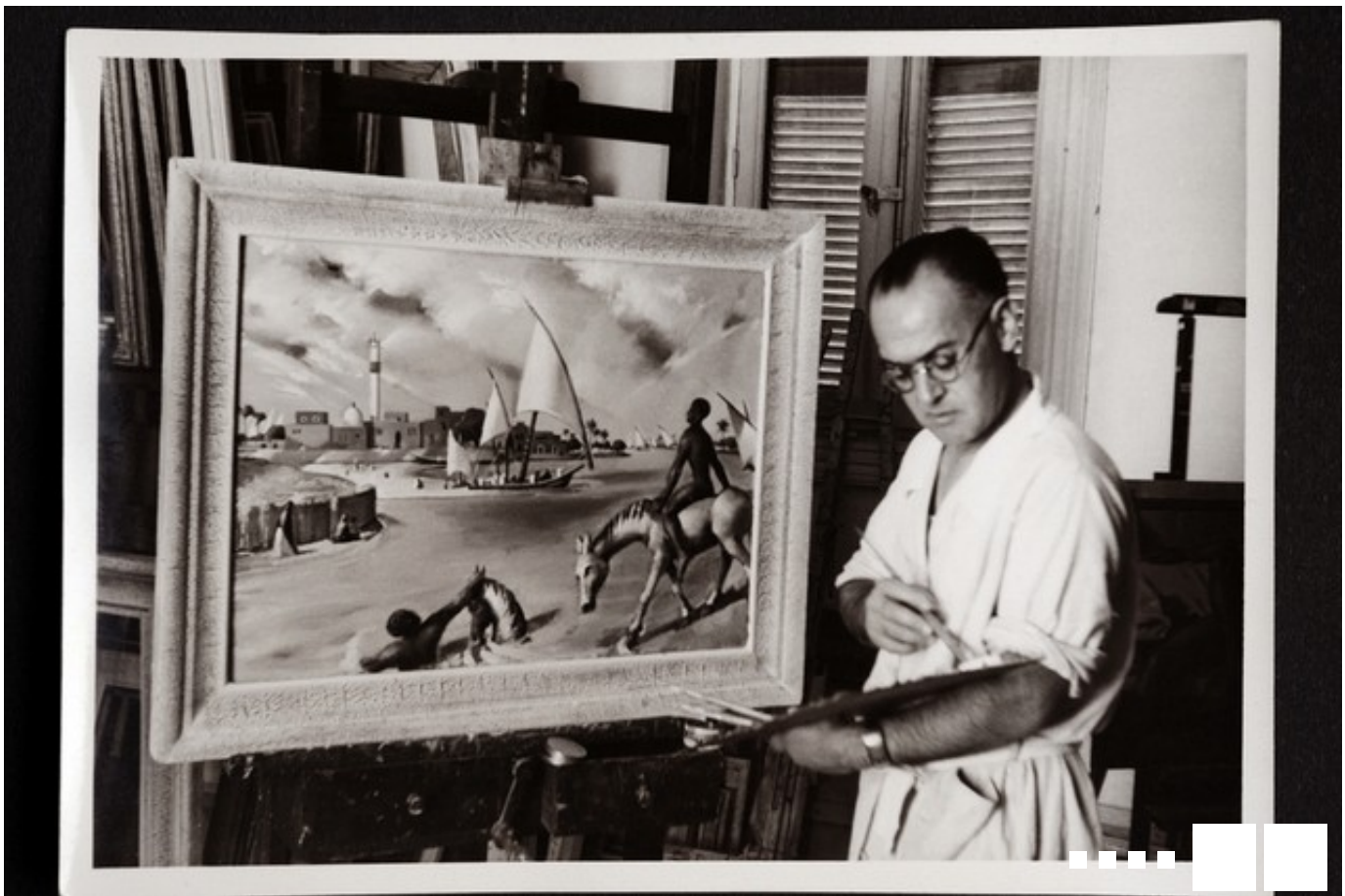
Mahmoud Said at his studio in Ginaclis, Alexandria, painting Bain de Chevaux a Rosette in 1950.